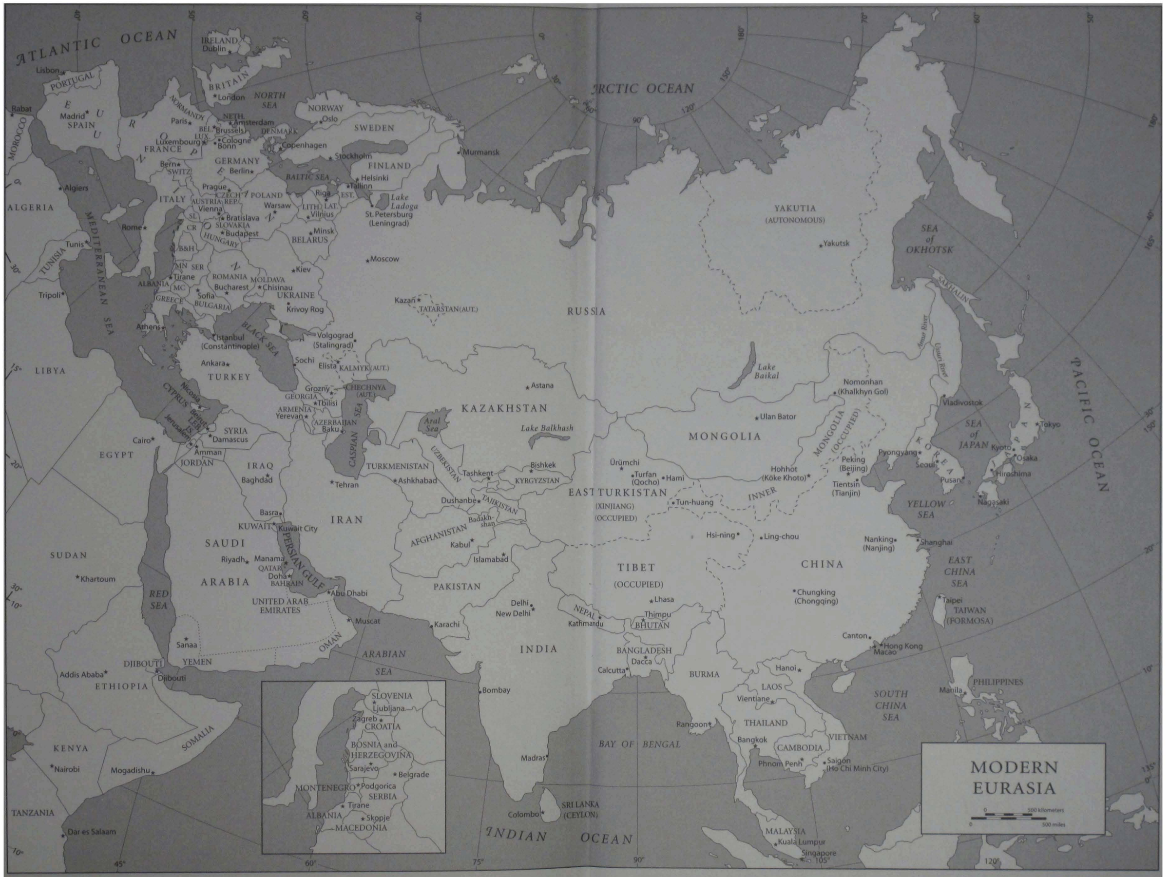
MODERN EURASIA 0 500 kilometers 0 500 miles